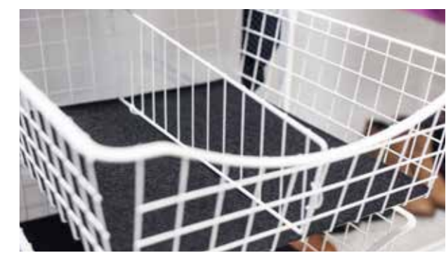
INLAY FOR BASKET